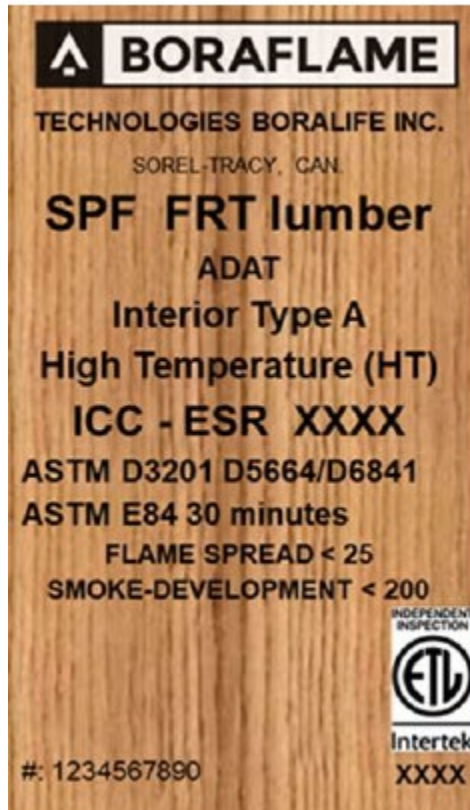
FIGURE 1—LUMBER STAMP

Zone 2: Where maximum ground snow load > 20 psf (960 Pa).